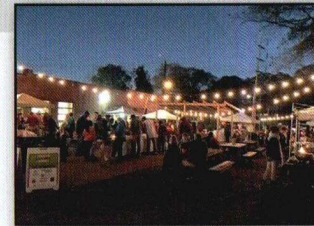
EAV Farmers Market