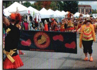
East Atlanta Strut

Through its committees, EACA supports many of the events the community enjoys in the East Atlanta Village.