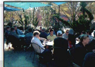
Neighbor In Need Poker Tournament