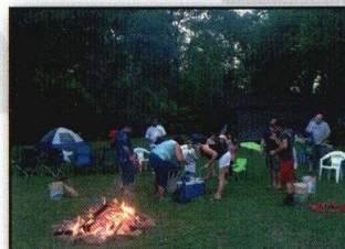
The Great American Backyard Campout